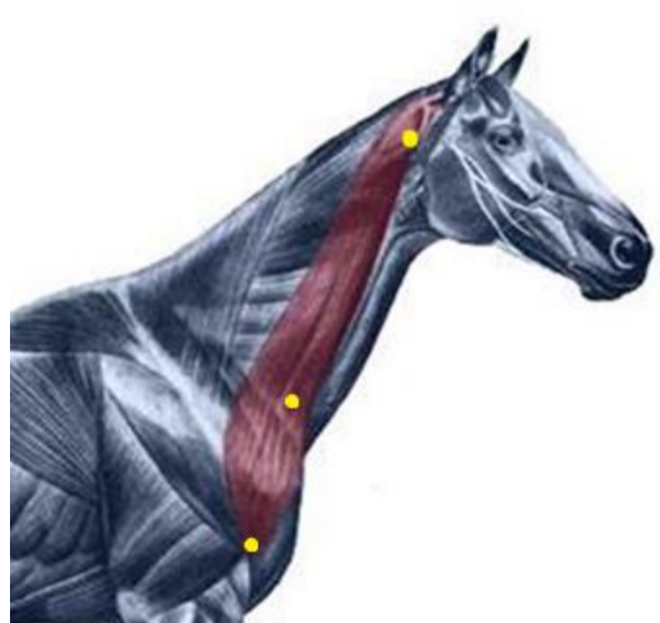
Plate 1.0: The EBc MNT Sites